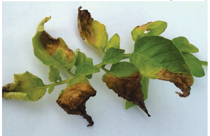
Figure 6. Lesions eventually turn to black necrotic tissue. These dead leaves serve as an overwintering environment for sclerotia.

secondary bacterial infections can enhance the development of other disease complexes. Infected flowers can spread infection to leaves and stems. In addition, direct contact with moist, infested soil or plant debris can promote infection.