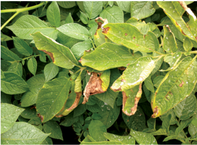
Figure 4. Initial stage of infection on the leaf margin.