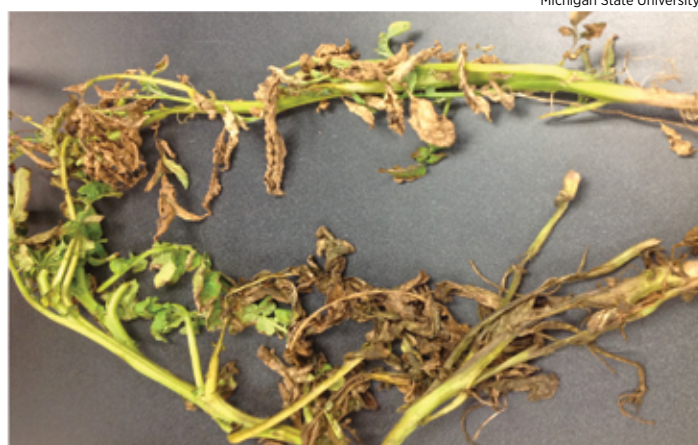
Figure 1. Early plant death of potato caused by Botrytis blight.

Grey mold is named for the grey conidia that appear on senescing plant tissue (Figure 2). The disease first appears as tan lesions (tan spot) (Figure 3) at the leaf margin (Figure 4). Leaf lesions are often seen on dying tissue or plants that have been damaged. Infection and colonization of leaves often lead to petiole lesions, which constrict the vascular system in compound leaves thus leading to decreased transport of photosynthates (figures 5 and 6). The mycelium spreads from the petiole to the main stem and causes stem lesions at sites of previous injury from fallen leaves or from insect damage, in particular, from corn stem borers. Girdling is the most common result of stem lesions, but under hot conditions complete stem