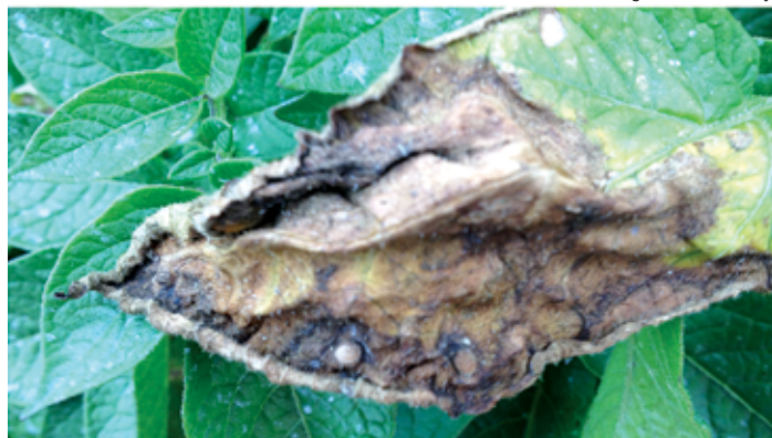
Figure 2. As tissue senescences, grey-black groups of conidia begin to form on the leaf surface.

rot may occur in the presence of secondary bacteria. Dry rot symptoms similar to those caused by Fusarium spp. may be seen on tubers in storage when inoculum levels are high.