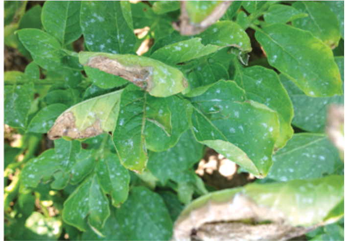
Figure 5. As the disease progresses, lesions become larger and necrotic.