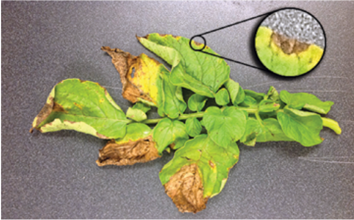
Figure 3. Tan lesions can be seen on the margins of leaves during the initial stages of disease. Over time, the lesions progress toward the primary vein.