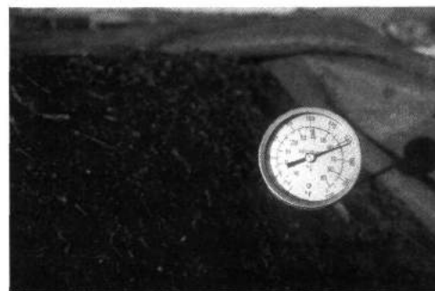
Compost temperature is the best indicator of process completion

Similarly, we have included a few of the hundreds of available information sources, again without the intent of endorsing any specific publication or service. With the information sources we have also included several public agencies and organizations that deal with composting.