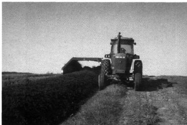
A compost turner keeps windrows aerated and produces the potting-soil-like texture