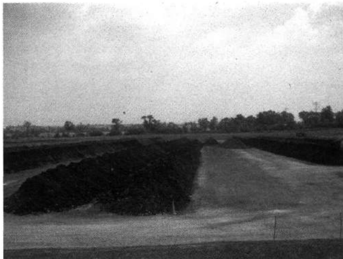
A firm pad base makes a weatherproof composting area

An important part of any composting operation is the location of the site and the construction of the pad. The site should allow for year-round access if it will be used all months of the year. The pad can either have a fixed location or move from site to site. If fixed, it will probably need to have a hard surface. Whether fixed or moving, there are several guidelines that should be followed to provide environmental protections: