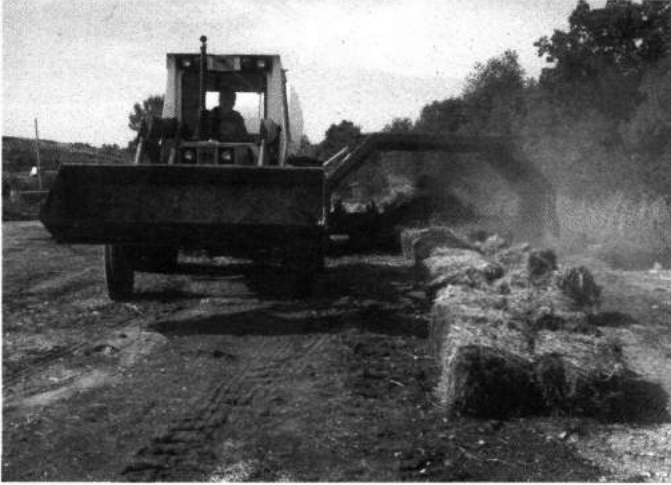
Old hay or straw can make a good foundation for a windrow when wet manure is to be composted