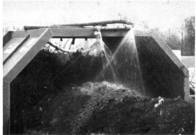
Poultry manure often needs added water to compost properly

At the end of the 18-week finishing period, birds have reached about 36 pounds and go to market. The barns are "de-caked" — accumulated