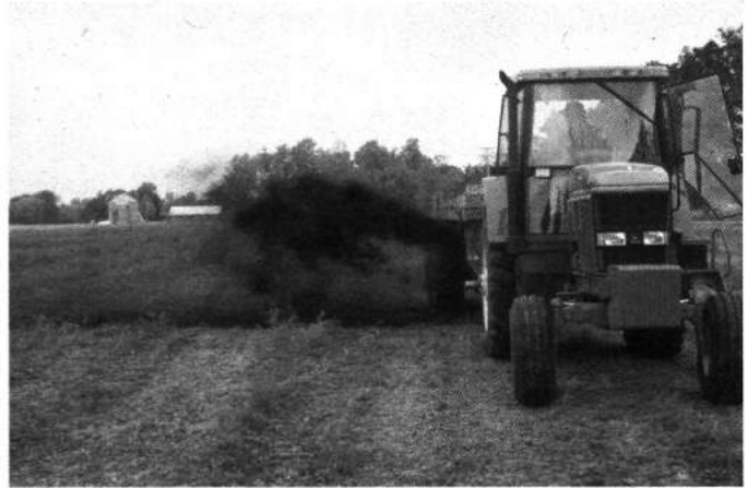
Finished compost is fine-textured and non-burning, so it can be topdressed on hay fields between cuttings

Because the nitrogen in compost is tied up in complex organic forms, it makes nitrogen available in complex ways. Only about 5-15 percent of the total N in compost is plant-available in the first season with much of the rest becoming available over the next six years. A fertility program based on compost has to account for this slow release.