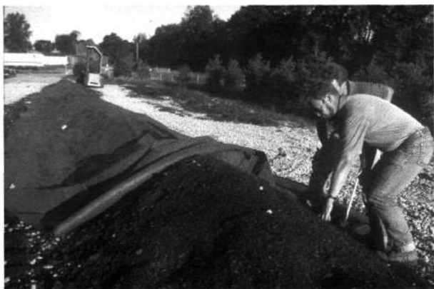
Fleece blankets protect composting windrows from excess rain and seem to make composting go better

Autrusa Company PO Box 1133 Blue Bell PA 19422 610/222-0937 610/222-0939 FAX info@autrusa.com http://www.autrusa.com