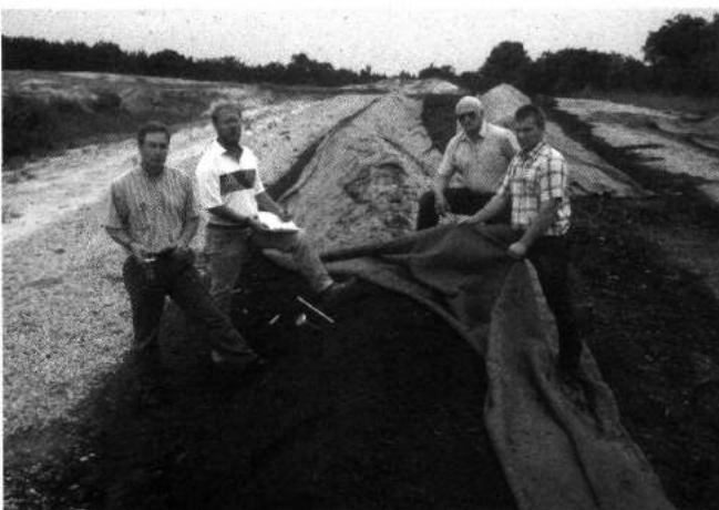
The Manure Management Demonstration Project in Ionia County showed farmers how to make compost