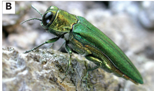
Michigan State University