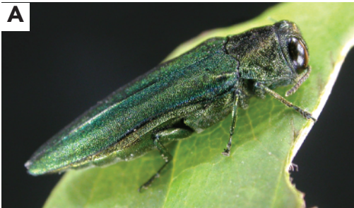
Michigan State University