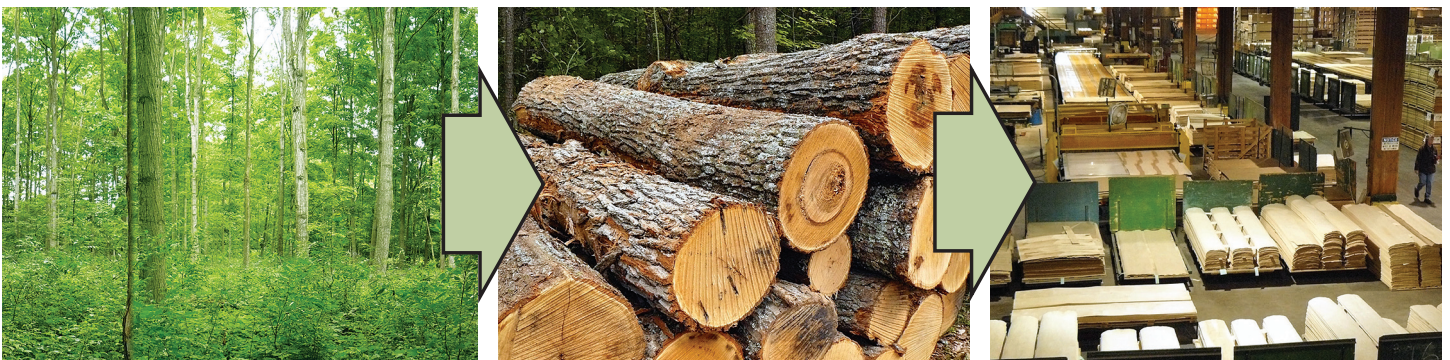
The economic chain from forest to consumer is a complex web of pathways, beginning with the forest and forest owner.

Forest owners need to be aware of certain things when deciding how to sell their timber. First, don't expect a logger's first offer to be the highest price possible. A logger's living, like that of any other business, depends on buying as low as possible. Second, there