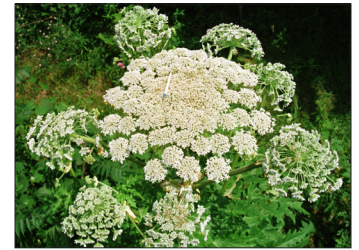
This giant hogweed leaf is 3 feet long. At right, a flower.

be 2.5 feet wide. The plant flowers from June to August in Michigan.