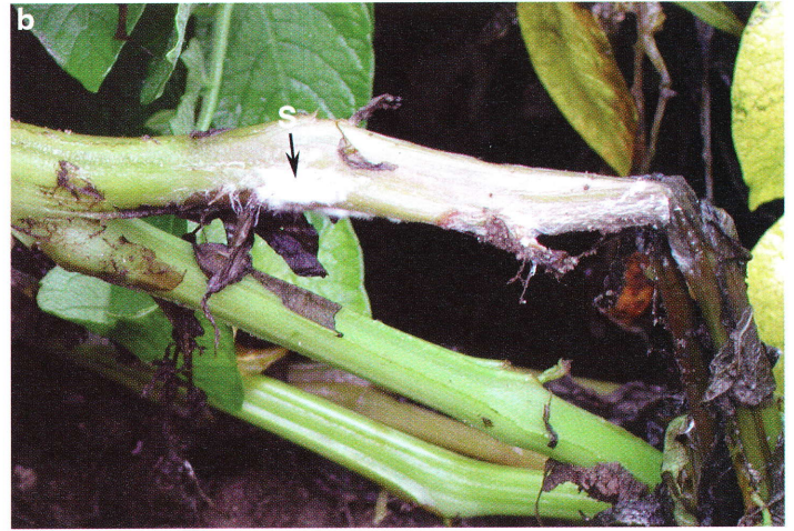
Figure 3. As infected tissue decays, hard resting structures called sclerotia (S) form inside (a) and outside (b) the decaying tissue.

lambsquarters, pigweed and nightshade. Sclerotinia sclerotiorum overwinters from one growing season to the next as sclerotia that can also survive in the soil for several years. Sclerotia require a conditioning period of cool temperatures before they can germinate, but these chilling requirements are normally met during Michigan winters.