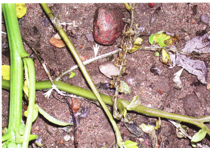
Figure 1. White mold lesions (L) usually first appear on branches and stems in contact with the soil. These become covered with a white cottony growth (arrows) and wilt.

White mold symptoms begin as water-soaked lesions 14 to 20 days following row closure, depending on the cultivar and cultural practices. Lesions usually first appear in the intersections between the stem and branches or on branches and stems in contact with the soil (Fig. 1). These become quickly covered with a white cottony growth that can spread rapidly