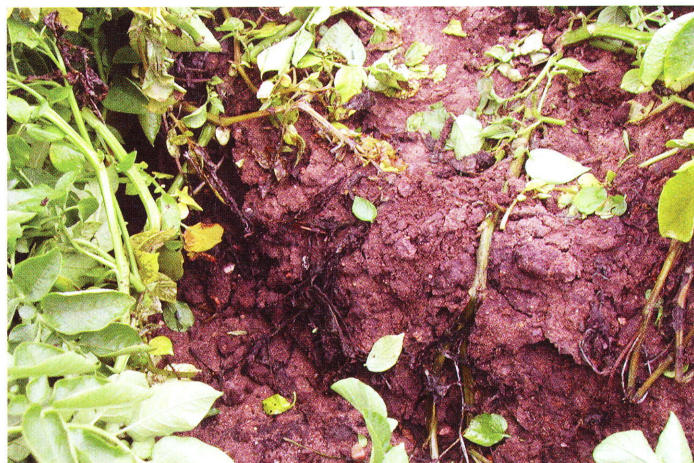
Figure 2. White mold lesions spread rapidly and can girdle stems, causing foliage to wilt.

White mold is caused by the soil-borne fungus Sclerotinia sclerotiorum . The pathogen causes disease in more than 400 plant species. Host plants in Michigan include dry beans, soybeans, alfalfa, peppers and tomatoes, as well as some common weeds associated with potato production, such as