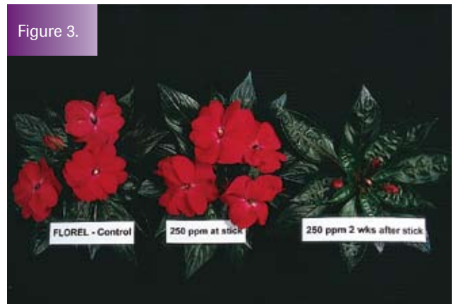
Figure 3. Effect of Florel spray on subsequent flowering. Florel usually does not delay flowering of vegetative cuttings if applied to cuttings at the time of sticking, but if applied later, flowering will be delayed.