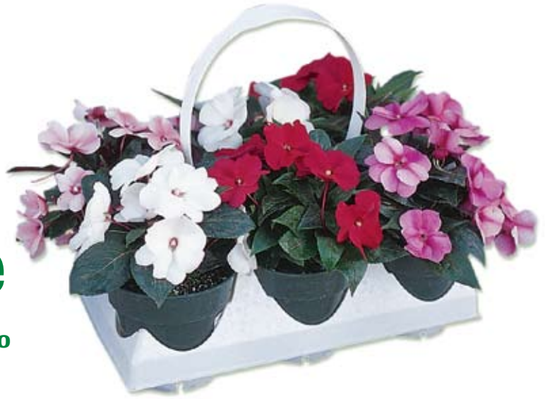
Figure 1. A six-pack of four-inch pots ready for sale.

New Guinea impatiens can be tricky to schedule for flowering on a particular day. These Michigan State University researchers unlock this plant's secrets.