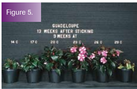
Figure 5. Effect of forcing temperature on New Guinea impatiens. Plants forced at 73°F (23°C) flowered rapidly and were very attractive.

(23°C) (Figure 5). Leaf and flower size decreased dramatically and many flower buds aborted at temperatures above 79°F (26°C) (Figure 6). Plant development is very slow when temperatures average less than 63°F (17°C).