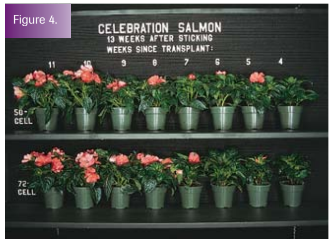
Figure 4. Holding plugs in trays for long periods can delay their flowering. From left to right, these plants were transplanted two to nine weeks after sticking in 50- or 72-cell plug trays. Flowering was increasingly delayed as time in the plug tray increased. Flowering was delayed more as plant density increased.

26°C). Under these conditions, plants should be well rooted and ready for transplanting three weeks after sticking if propagated in plug trays. They can be held longer in the plug tray if rooted in larger cells such as 50-cell trays. Crowding cuttings will cause shoots to stretch and flowering may be delayed (Figure 4).