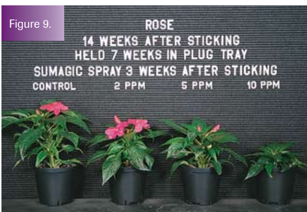
Figures 8 and 9. Sumagic is very effective for height control of New Guinea impatiens. Cultivars differ in their response – even two ppm was excessive for compact varieties like 'Celebrette Cherry' but worked well for 'Celebration Rose' in this experiment.

and control them with a thorough spray program. Like the viruses they carry, thrips have an extensive host range and will feed on many species of plants.