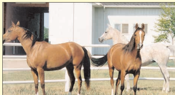
Figure 1. Horses are part of the landscape of agriculture.

It is very important that horse owners develop and implement plans for handling and disposing of manure. To avoid or ignore the issue may be a long-term recipe for disaster to the Michigan horse industry.