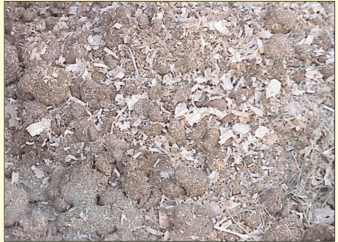
Figure 2. Feedstock is a combination of manure and bedding material.

Wood shavings in horse manure present another concern (Figure 2). Horse manure alone can provide a rich organic source of nitrogen to the soil, but wood shavings spread on a field can actually remove nitrogen from the soil. As a pasture or crop field becomes low in nitrogen, plant growth, quality and yield decrease while weed production increases.