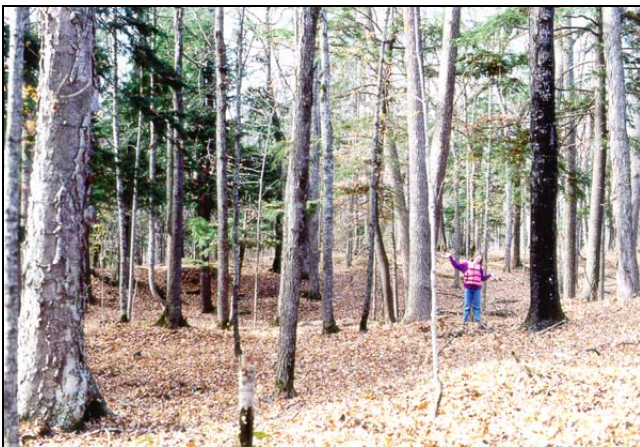
Northern hardwood forest, the most common forest type in Michigan.

Stated most simply, biomass is tissue produced by living organisms. In an ecological sense, it is usually measured in dry weight per unit area, such as tons per acre. In a forest, trees produce huge amounts of biomass. Wood is one form of that biomass, along with leaves, bark, flowers, fruit, etc. Woody biomass has been used by humans for millennia for a variety of purposes. Wood is one of the most common (and ecologically friendly) raw materials that society uses. In current markets, and with growing concerns about carbon and fossil fuel consumption, biomass has come to mean a potential alternative fuel source for energy. Of course, woody biomass has been used as an industrial and residential fuel for a long time. Yet, emerging technologies are changing the face of that market.