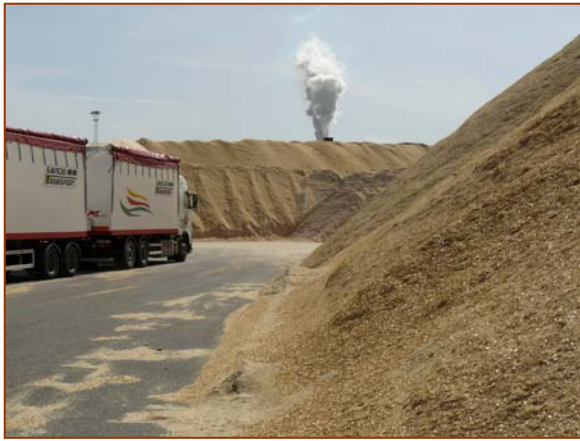
Piles of shredded wood at a large pellet manufacturing facility.

geographical distribution of forests and forest types, ownership patterns, procurement systems, and other variables.