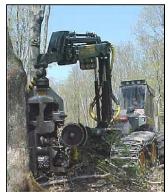
Harvesting processor at work.