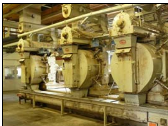
A pellet die that fits into a pelletizing press.

Finding pelletizing technology is not difficult. A number of market-ready, off-the-shelf systems can be considered. Pellets are formed under heat and high pressure by extruding fiber through a heavy die. No adhesives are required with adequate feedstock mixes. Feedstock must be dry before pellets are made.