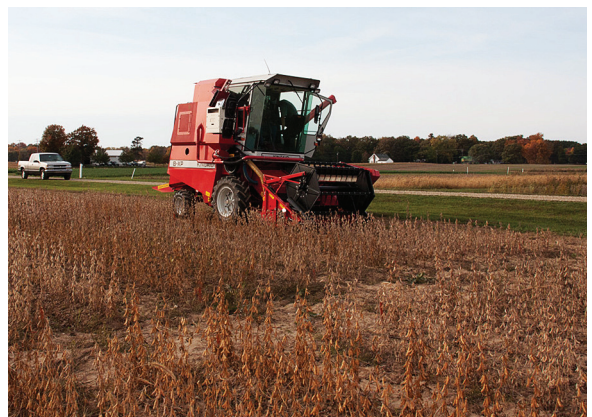
Harvest at the W.K. Kellogg Biological Station site.