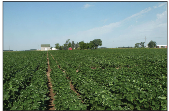
Tuscola Co. site.