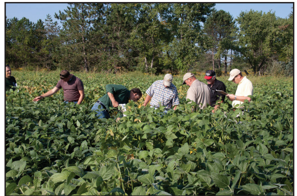
Field tour at Lapeer Co. site.