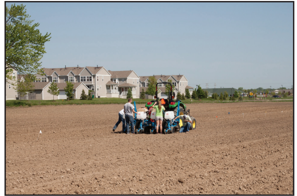
Planting at Isabella Co. site.

It often benefits growers to select a few good varieties for planting each year. Yield determination and careful field evaluation during the growing season will add to the grower's knowledge of variety performance and allow for better selection.