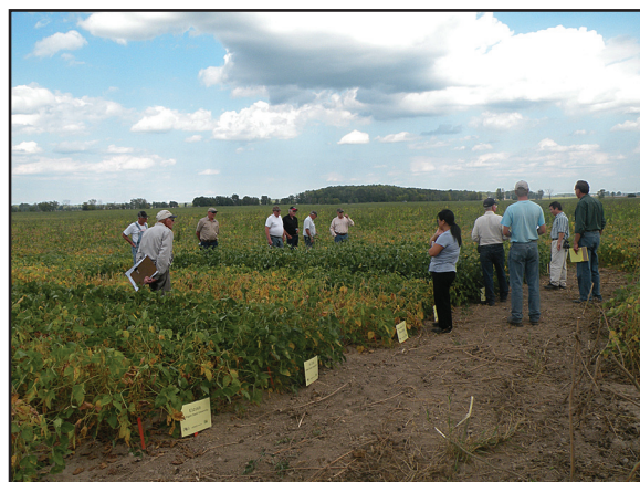
Farmers, breeders and project team review soybean varieties during the Sept. 6, MSU Extension Summer Organic Tour.