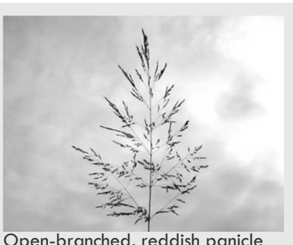
Open-branched, reddish panicle