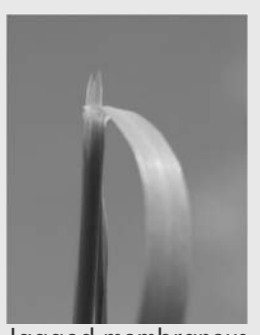
Jagged membranous ligule