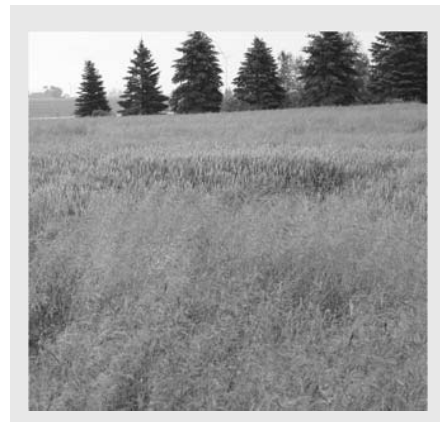
Windgrass in a Michigan wheat field

Common windgrass (Apera spica-venti L.) is a winter annual grass species that has become more of a weed problem in winter wheat production. In the past the distribution of common windgrass in Michigan has been limited. However, over the last several years this weed has been reported in several counties. Management of this weed can be difficult because the emergence pattern and growth closely coincide with winter wheat, and the availability of selective herbicides is limited.