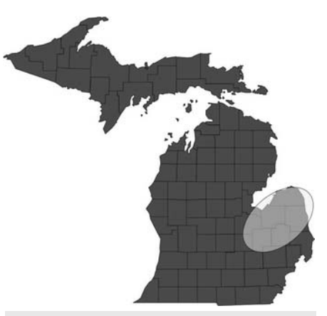
Common distribution of windgrass in Michigan