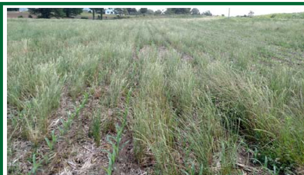
Figure 5. Failed control of annual ryegrass prior to corn planting resulting in crop competition and seed production.

Termination timing in the event another application or different method is required. Occasionally multiple herbicide applications will be required to successfully terminate a cover crop (Figure 5). Early termination allows for flexibility should a second application be needed.