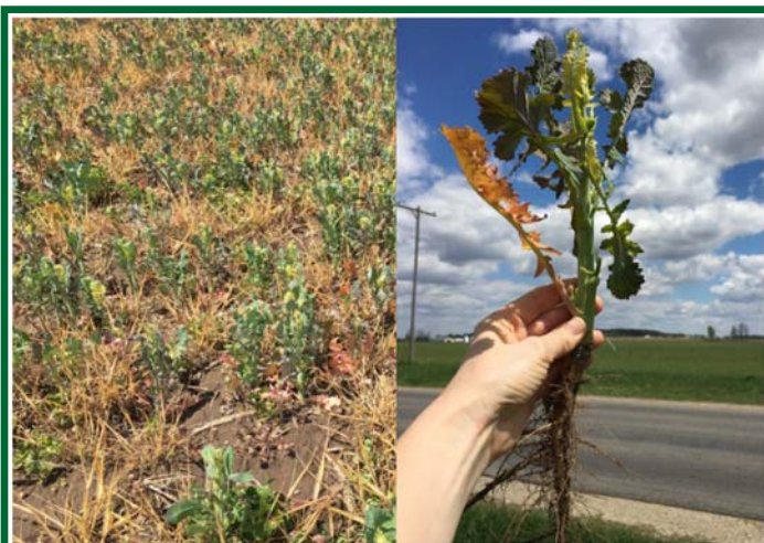
Fig 4 Glyphosate terminated the cereal rye (left), but failed to control bolting rapeseed (right) in this two-species mixture.

Termination prior to flowering. Plants that have started to flower (reached the reproductive stage) may be difficult to control as the movement of photosynthates change in the plant, thereby altering the movement of herbicides that are translocated (Figure 4).