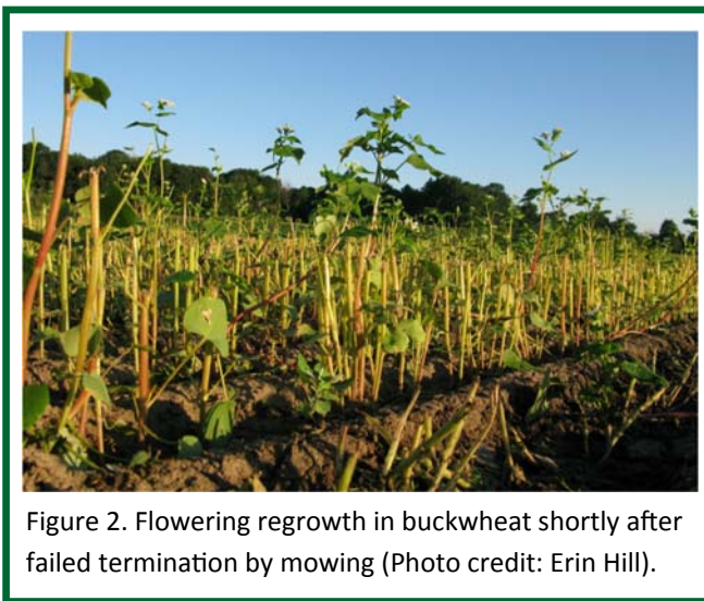
Figure 2. Flowering regrowth in buckwheat shortly after failed termination by mowing.

In systems that include tillage, or are managed organically, mechanical soil disturbance can be a reliable method of cover crop termination. A moldboard plow is the most effective tool to manage dense stands of overwintering cover crops. Chisel plowing is also an effective method for termination of most cover crops. However, multiple passes may be required if large amounts of cover crop biomass are present. Rototillers can also terminate cover crops when biomass levels are low enough to avoid clogging. Vertical tillage tools are not reliable for cover crop termination. Mowing is also not a reliable method of terminating most cover crops (Figure 2).