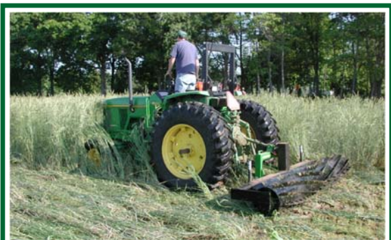
Figure 3. Roller crimping cereal rye.

dates. Examples of cover crops that have been successfully terminated using the roller crimper include cereal rye (Figure 3) and hairy vetch. Success is dependent on the stage of the cover crop, with these two species required to reach the point of flowering (Feeke's 10.5/Zadoks 60, for cereal rye). Crimping prior to flowering may result in continued growth. However, waiting until the time of flowering adds the risk that viable seed could be produced, resulting in volunteer plants emerging in the future. Utilizing the roller crimper in combination with herbicides increases the likelihood of successful termination.