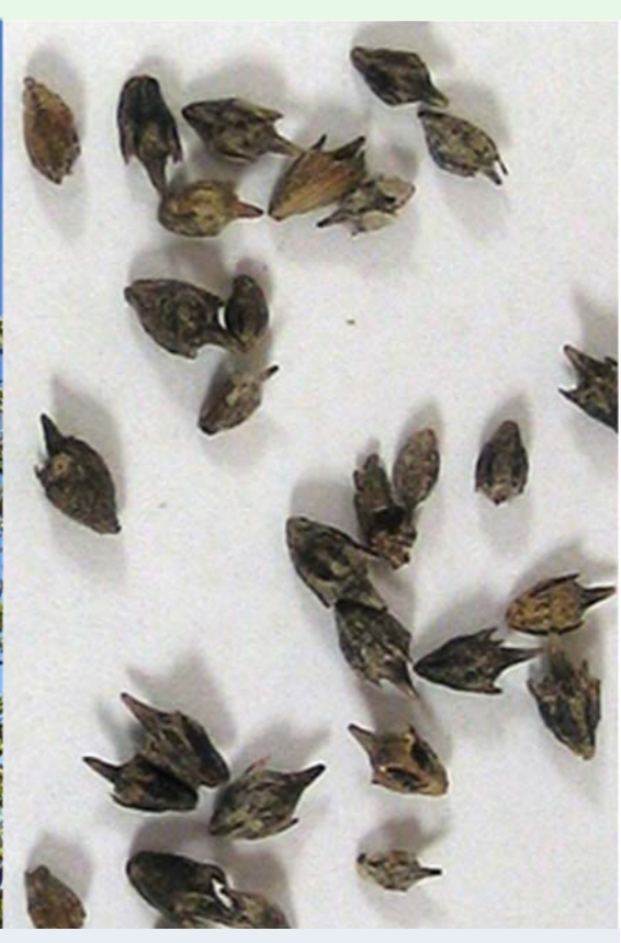
Seeds located in leaf axils, not top of plant