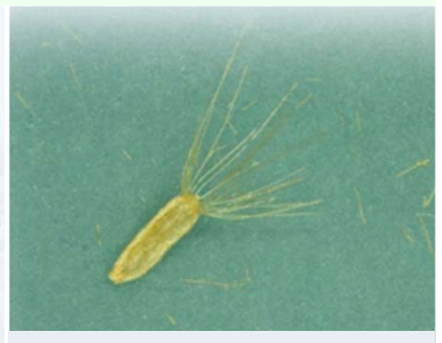
Immature horseweed seed