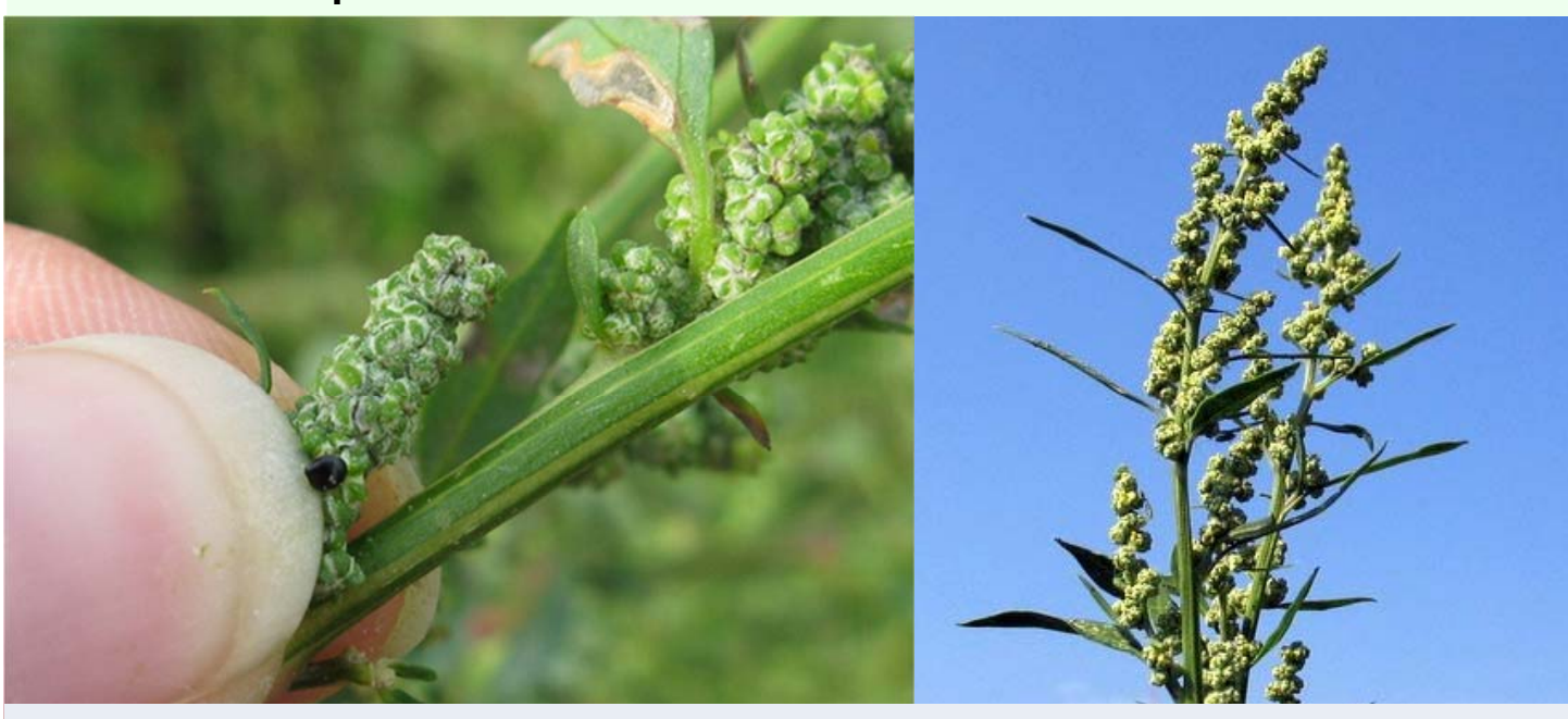
Brown or black seed is formed at the top of the plant and end of branches