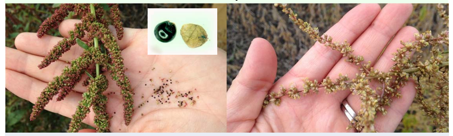
Female plant with seeds