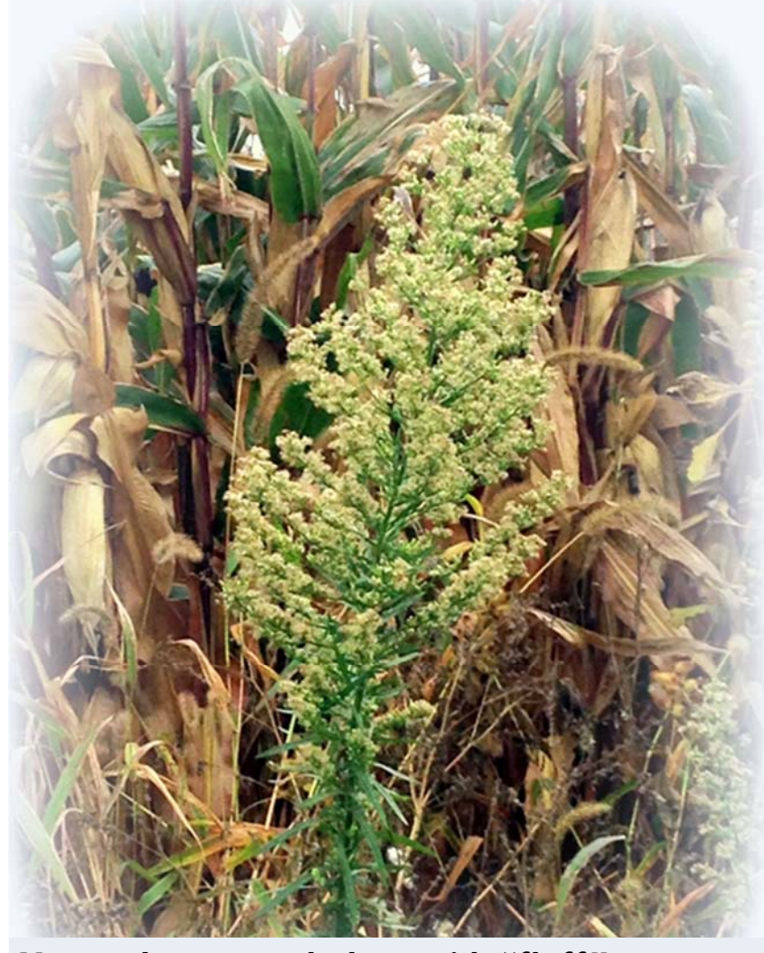
Mature horseweed plant with "fluff"