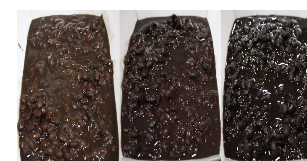
'Eclipse' 'Zorro' 'Zenith'