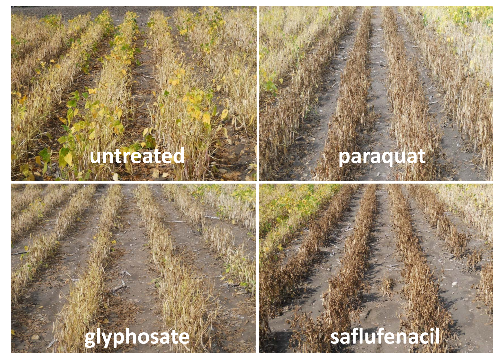
Figure 1. Black bean desiccation with various treatments, 3 DAT.