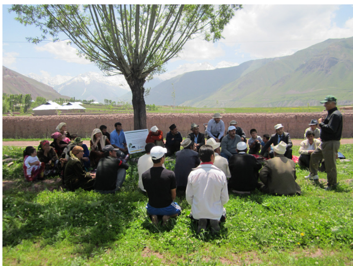
Farmers meeting, Muckoy Jamoat, June 15, 2011

“In order to address the growing need for availability and quality of livestock feed in Tajikistan, we began an exploratory project to identify production issues that will be essential for the improvement of livestock production.”