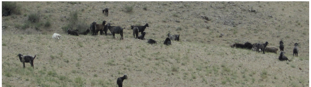
Sheeps and goats on the summer pasture.

In addition to warming temperatures and a growing livestock industry, Tajikistan has also experienced severe deforestation. The lack of plant fuel means more and more animal manure is used for heat and cooking fuel instead of fertilizer, which further degrades the quality of pastures and increases the need of supplemental feed for livestock.