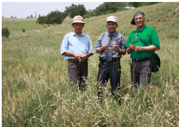
Cultivated Oats. Khatlon, Tajikistan

The demonstration sites also served as a focal point for teaching local farmers and NGO representatives about the benefits of planting forage crops and shrubs as both livestock forage and household fuel. The sites will help us to develop more comprehensive training programs, in both Tajik and Russian, to communicate with more local stakeholders about good livestock management and agricultural practices, including seeding pasture land with forage crops and seasonal pasture rotation.