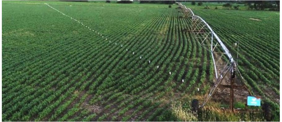
Figure 1: Catch Can Test Demonstration

The catch can method is simple and effective in evaluating the uniformity of the irrigation system. The procedure includes placing 32 oz disposable soda cups at 10 ft distance apart in a straight line outward from the pivot elbow. Once the catch cans are installed in the field, start the irrigation, then measure the water level in each of the cans using a graduated cylinder and recorded. Figure 1 shows a demonstration of the catch can test in Three Rivers, MI.