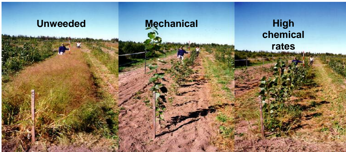
Trees at the Escanaba location at the end of the first growing season.

Michigan State University makes no endorsement or guarantee of the herbicides referred to in this publication.