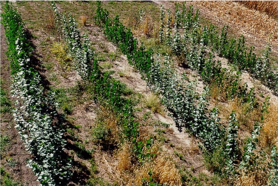
East Lansing site near the end of the second year.