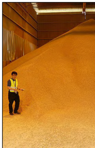
Pellet storage area.

Nevertheless, they remain practical and low-cost alternatives in some situations. Some manufacturers have produced more efficient home furnaces that do meet air quality standards.