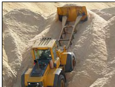
Raw material--ground wood.

The simplest technology for wood is direct combustion to produce heat. While wood has been used as a heat source for millennia, the technologies now employed to extract and distribute wood-generated heat vary. Many home furnaces, both indoor and outdoor, are inefficient and cannot be used where air quality standards apply.