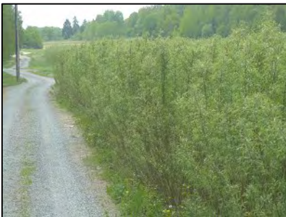
Willow energy plantation.

Employing appropriate wood-using technologies depends on the available wood resources, transportation systems, and existing wood-using facilities. Integrating systems with existing power plants and industries such as pulp and paper mills can increase market flexibility and spread costs over a larger infrastructure. Economies of scale might be gained by complementing and integrating a local operation.