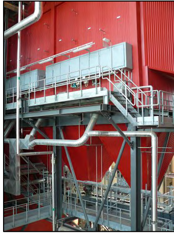
Large CHP plant boiler.

distributed through a District Energy grid. Efficiencies are high, and small to large cities can be served by CHP plants. St. Paul, Minn., has a CHP plant that largely runs on municipal solid waste. Both district heating and CHP plants can also produce pellets for local housing that is outside of the hot water grid or for sale to larger markets.