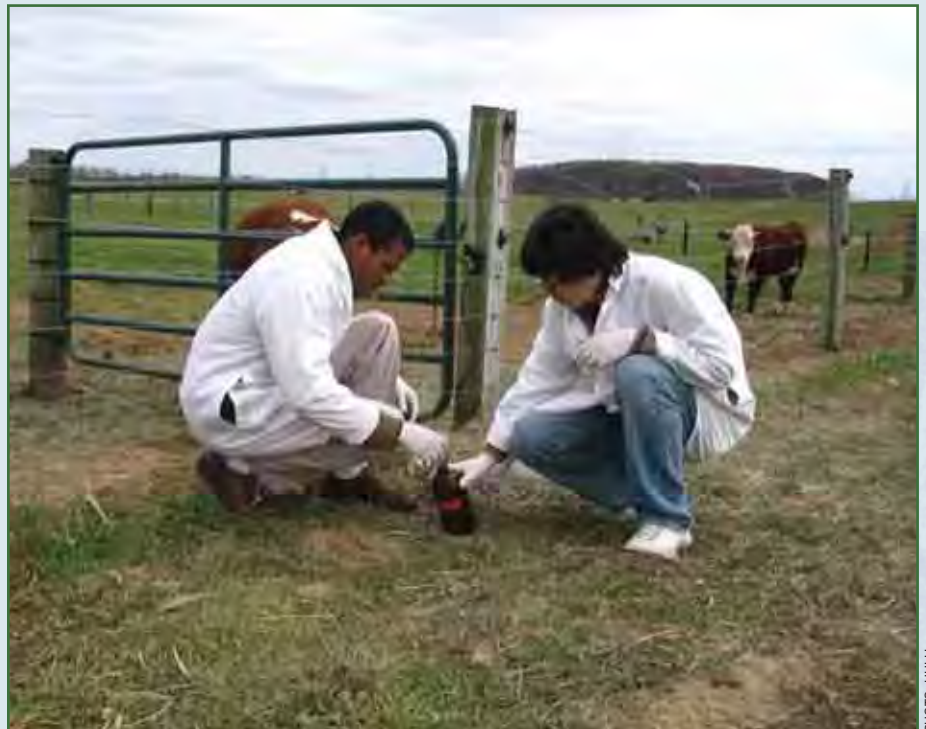
THE INTRODUCTION OF ANTIBIOTIC-LACED MANURE TO SOILS IS AN EMERGING AREA OF RESEARCH.